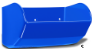
STYLE CC-HD High Density Polyethylene Elevator Bucket Urethane • Nylon

“We Make it Right!” is more than a tagline for International Ingredient Corporation. All key components of basic diet processed by this feed ingredient manufacturer are research proven. International